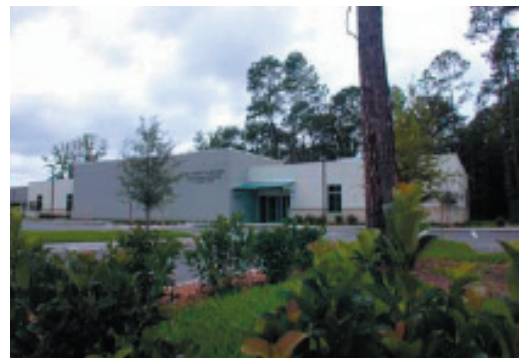
The Charles M. Neviasser Educational Institute, a 10,000 SF instructional facility in Jacksonville. This extension of the Community Hospice campus contains the Hospice Foundation for Caring, an education and outreach program, grief and bereavement services, and a venue for conducting research and development. TTV Architects, Inc. was in charge of the Schematic Design, Design Development, Construction Documents, and Construction Administration.