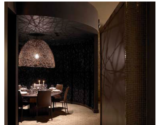
Intimate areas are created within the main dining room through the skillful use of dramatic lighting, a warm color palette ranging from light to dark, and textures from smooth to rough.