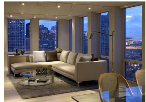
The design of this space highlights both the architecture of the building and the city views, while creating a luxuriously warm space with a modern and intimate sophistication.